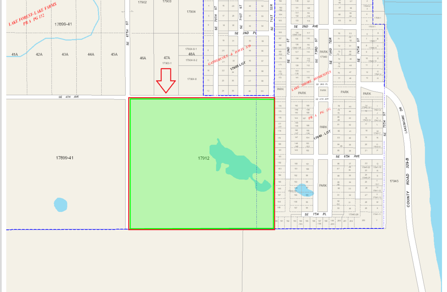
Image showing the location of parcel