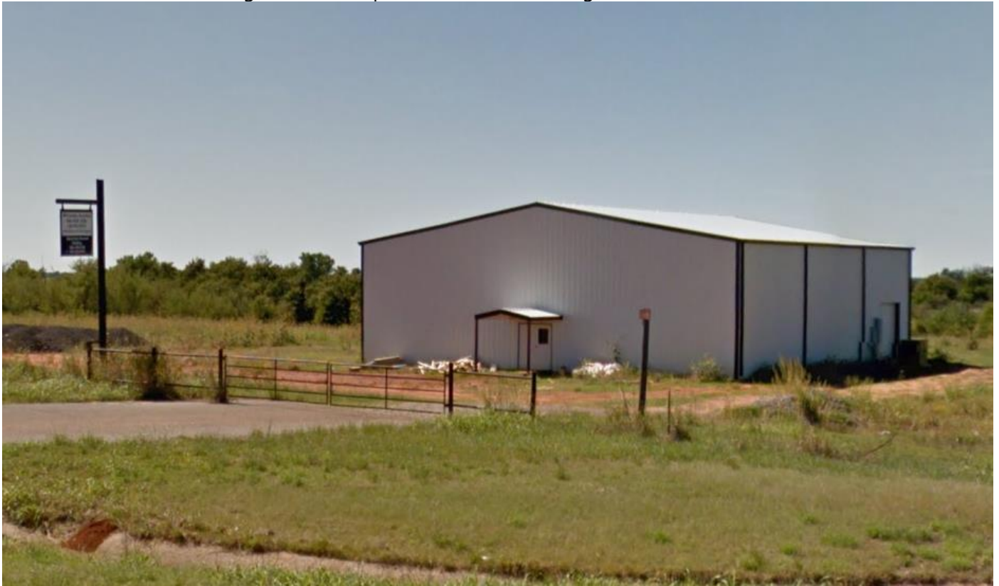
Property valuation details