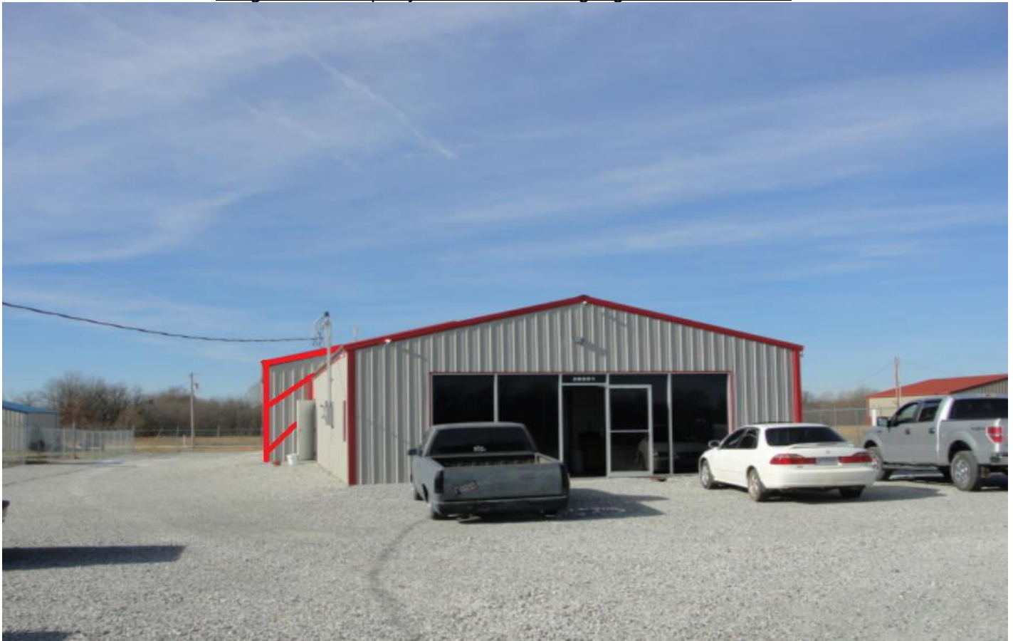
Information from the property assessment